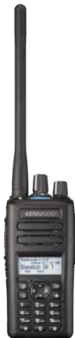
Model "E" Display/Full keypad