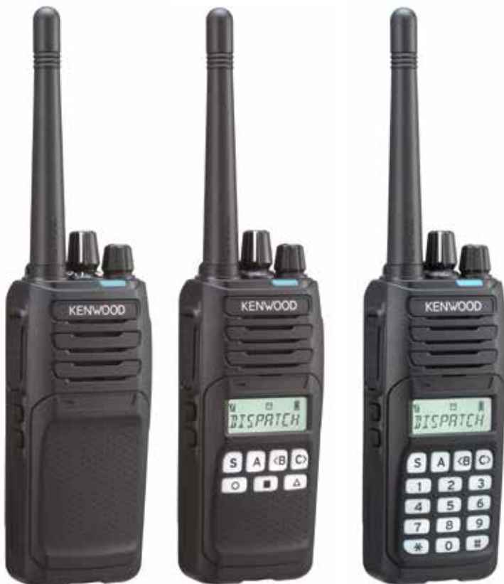
Basemodel "E3" without Display