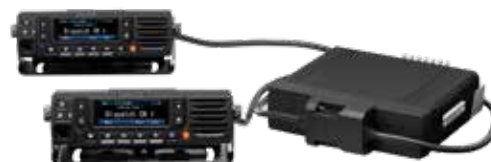
NX-5000 Series Example configurations