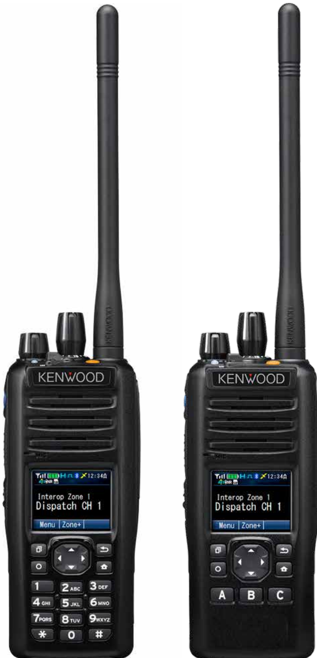
Model "E" Display/Full Keyboard