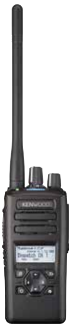
Model "E2" with Display