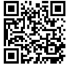
Kenwood Solution Developers