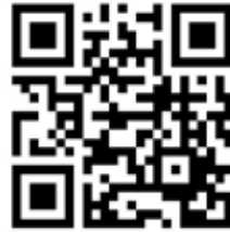
Kenwood Communication Germany