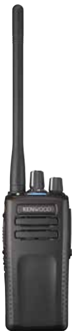
Basemodel "E3" without Display